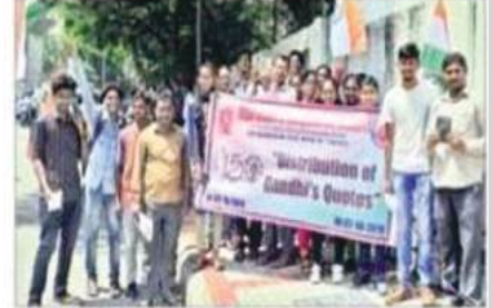
భైరతాబాద్ కూడలిలో వేడుకలు నిర్వహిస్తున్న విద్యార్థులు