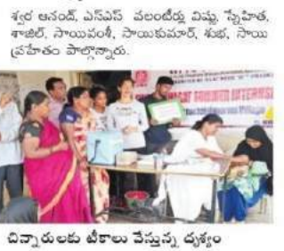
చిన్నారులకు టికాలు చెప్పిస్తూ దృశ్యం