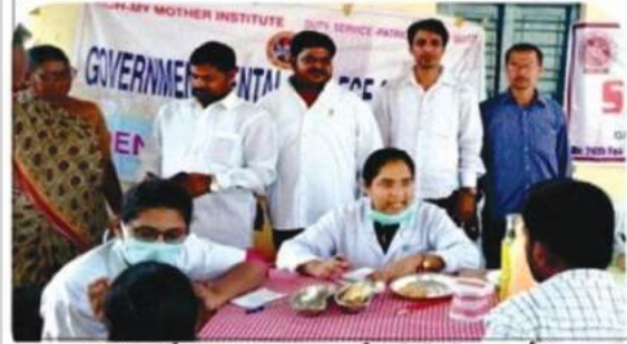
మండలంలోని కాచవాని సింగారంలో ఎన్ఎస్ఎస్ వాలంటీర్ల ఆధ్వర్యంలో ఉచిత వైద్య శిబిరంలో లోగులకు పరీక్షలు నిర్వహిస్తున్న దృశ్యం.